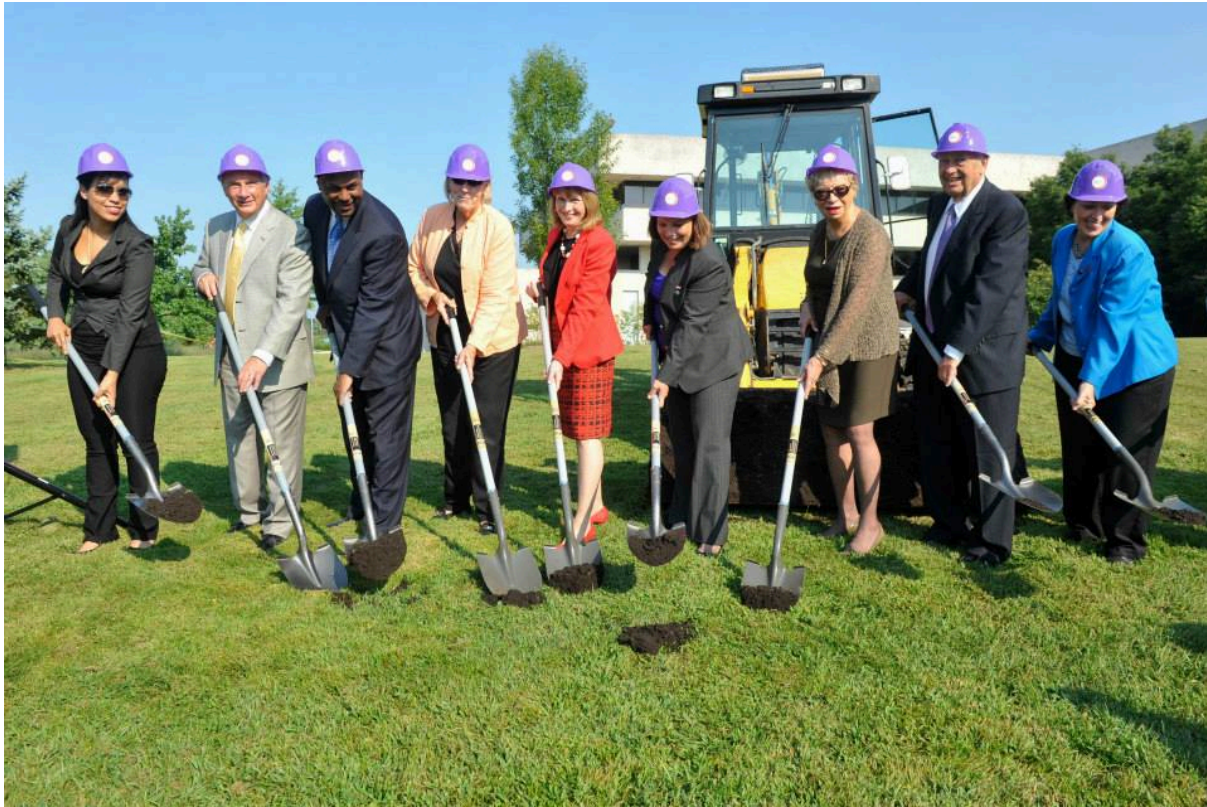
Health Professions Integrated Teaching Center Groundbreaking